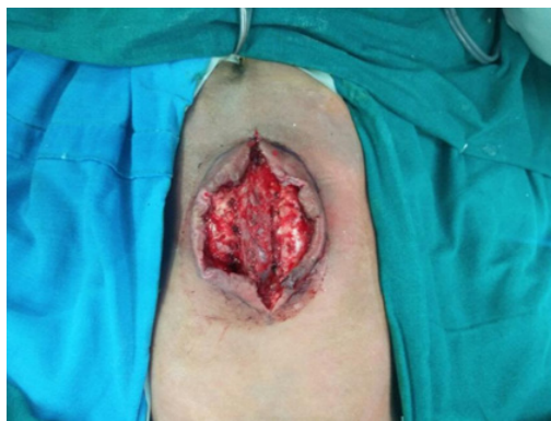
Figure 3: Case 1. Myelomeningocele defect, after release of tethered cords