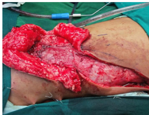
Figure 4: Case 3. Reverse latissimus dorsi muscle flap and gluteus muscle flap to cover the myelomeningocele defect

The skin adjacent to the defect was advanced to close the defect. She developed CSF leak manifesting as swelling in the operated site and also excess drainage collection. She was reexplored to correct the CSF leak. The dura was reinforced with sutures and glue. The reverse latissimus dorsi turnover flaps were used to cover this complicated myelomeningocele defect. Here, the distal end of the latissimus dorsi flap was not showing adequate vascularity and was debrided. This flap was able to cover only the upper two thirds of the defect. A contralateral gluteus maximus muscle flap was advanced to the lower part of the defect [Figure 4]. The skin was advanced to cover the defect. The wound healed well with no complications.