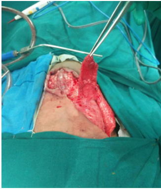
Figure 1: Latissimus dorsi muscle flap raised based on the secondary pedicle